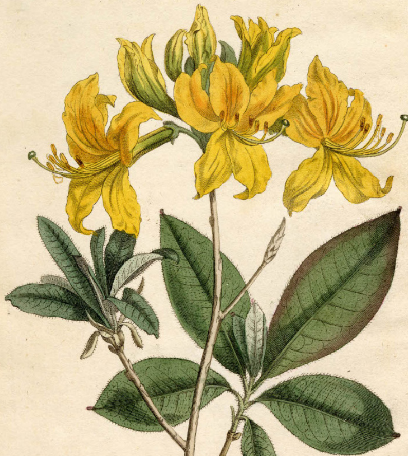
From the Pharmacy Historical Collection at the HSHSL: Curtis, William. The Botanical Magazine or Flower-Garden Displayed. Vol. 13. 1799. Plate No. 433.

The 2023 HSHSL Calendar, "Fatal Beauty," featured a selection of stunning botanical plates from volumes in the HSHSL's Historical Pharmacy Collection. The calendar showcased botanicals that, if used improperly, can be deadly.