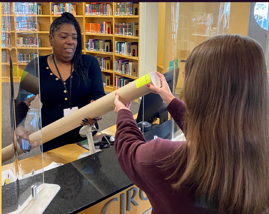
A member of the Information Services team hands a poster to a student.

A convenient service supporting conference presentations