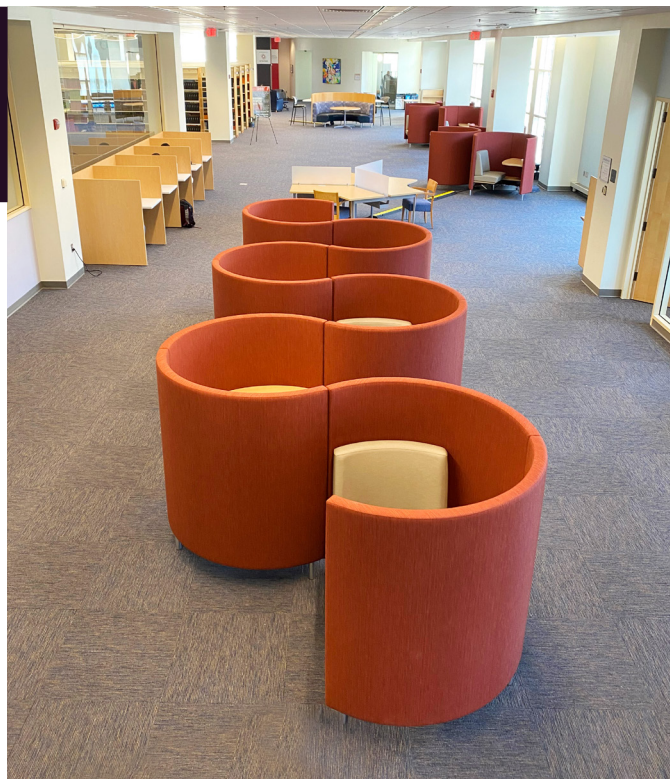
Third Floor Study Space

After purchasing more than 1,000 digitized older journals over several years, the HSHSL was able to remove 34,000 print volumes. This provided the opportunity to design additional study space. The project involved removing print journals, shifting the collection, pulling up shelving, and installing carpeting. The project team made sure to get student input on furniture preferences before designing the layout. The new study area includes individual study pods, diner-style banquettes, computer tables with monitors, and new tables in the study rooms. The new area is light-filled and comfortable – a destination study space for students.